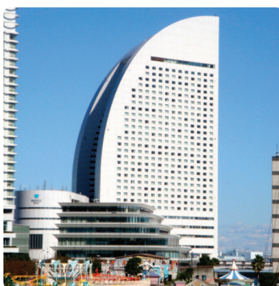
The PACIFICO Yokohama and the iconic building of the InterContinental.

numerous tourism opportunities, such as the nearby historical city of Kamakura with the Great Buddha or the hot spring resort Hakone, which has a beautiful view of Mt. Fuji. Tokyo, a metropolis like no other, has been Japan's cultural center since the Edo period in the 17th century and is at a crossroad where over 400 years of history and tradition meet with cutting-edge modern innovation. Tokyo offers a uniquely eclectic mix of traditional and modern attractions including Asakusa, Ueno, Ginza, Roppongi, Shinjuku, Shibuya, Harajuku, and Omotesando.