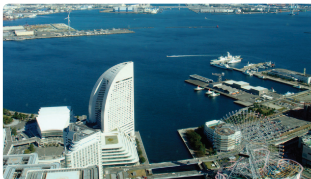
The PACIFICO Yokohama and the waterfront "Minato Mirai 21" district.

The organizing committee is composed of members from the Tokyo Institute of Technology (Tokyo Tech), several universities in the Yokohama and Tokyo area, and various universities world-